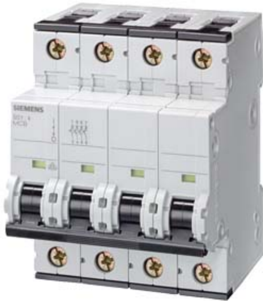
CIRCUIT BREAKER 400V 6KA, 4-POLE, C, 25A, D=70MM