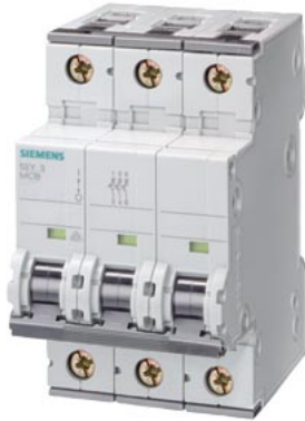
Miniature circuit breaker 400 V 6kA, 3-pole, B, 16A, D=70 mm