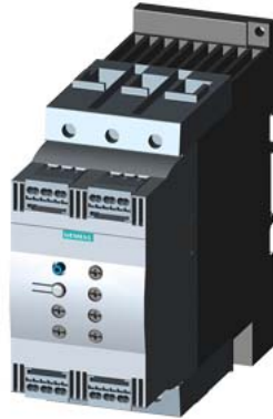
SIRIUS soft starter S3 106 A, 75 kW/500 V, 40 °C 400-600 V AC, 110-230 V AC/DC spring-type terminals