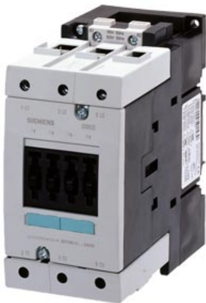
CONTACTOR, AC-3 37 KW/400 V, AC 230 V, 50 HZ, 3-POLE, SIZE S3, SCREW CONNECTION