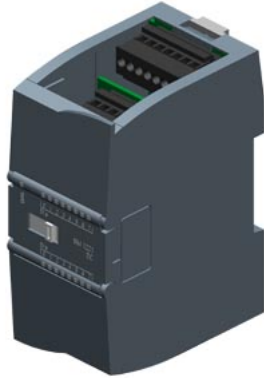
SIMATIC S7-1200, Digital input SM 1221, 16 DI, 24 V DC, Sink/Source